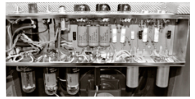
just grounded one leg of the 6.3V to the chassis, (to use it as one side of the filament), and ran one wire to the other side of the filaments. We use the same wire routing, the same construction techniques with brass eyelets, all carbon comp Allen Bradley resistors, Carling switches, and the tube sockets are NOS made for the military in 1952.

Yes, exactly the same. Probably where we vary a little bit is that we use a center tap 6.3V filament winding and Fender